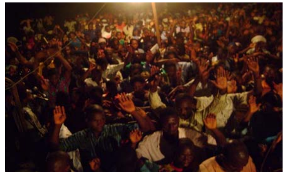
People receiving Christ as their Savior during the convention

"God Reigns over the Nations." Psalms 47