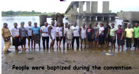
People were baptized during the convention

"God Reigns over the Nations." Psalms 47