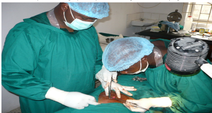
Doctors perform surgery on a patient through the church program.

Sing praises to the Lord, enthroned in Zion; proclaim among the nations what he has done. Psalms 9:11