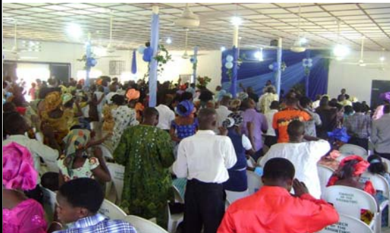
People praying during convention

That first night the word of God came with clarity and conviction. Some estimates have it that about a thousand persons come forward to receive Christ. The other two nights had a greater attendance and response coupled with prayers for the healing of the sick. Surely the Lord did visit Ozoro and the blessings only just began.